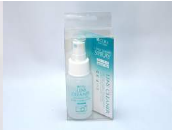
CLCS-050 Lens Cleaner Spray(50ml bottle)

Very popular among camera connoisseurs and camera repairmen, this Lens Cleaner contains no Alcohol, but a high dilution blend of industrial pure water and mild detergent. Works best when used with CuraMicroWiper, leaving no residue on the surface even wiped roughly.