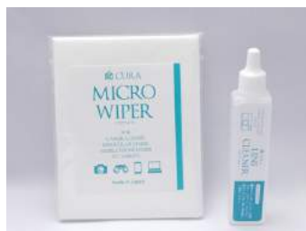
AST-015 Cleaner & Wiper set(Cleaning Paper 30 sheets Liquid 15ml)

Very popular among camera connoisseurs and camera repairmen, this Lens Cleaner contains no Alcohol, but a high dilution blend of industrial pure water and mild detergent. Works best when used with CuraMicroWiper, leaving no residue on the surface even wiped roughly.