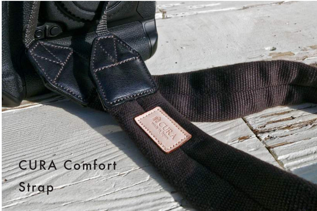
CURA Comfort Strap