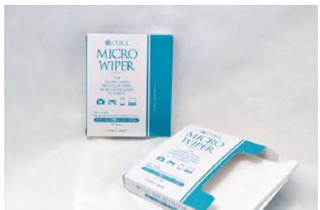
CP-100 Cura Micro Wiper(Cleaning Paper 50 sheets / package)

CP-100 Cura Micro Wiper(Cleaning Paper 50 sheets / package) 380JPY / 1pcs CP-250 Cura Micro Wiper(Cleaning Paper 250 sheets / package) 11,00JPY / 1pcs