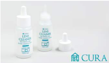
CLC-300/050 Lens Cleaner (300ml/50ml bottle)

CLC-300/050 Lens Cleaner (300ml/50ml bottle) 3,000JPY / 300ml 800JPY / 50ml CLCS-050 Lens Cleaner Spray(50ml bottle) 880JPY / 50ml