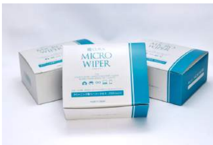
CP-250 Cura Micro Wiper(Cleaning Paper 250 sheets / package)